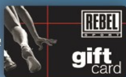
Rebel Gift Card