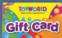
Toyworld Gift Card