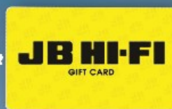
JB Hi-Fi Gift Card