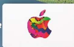
Apple Gift Card